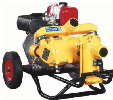
Spate 75C (stone catcher optional extra)